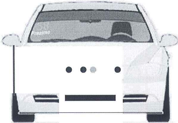
Prednjem vetrobranskom staklu. broj je visine 14cm sa debljinom niže od 2cm, font je ArialBOLD