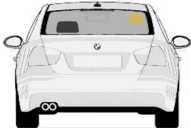
Zadnjem vetrobranskom staklu. broj je visine 14cm sa debljinom linije od 2cm, font je Arial BOLD