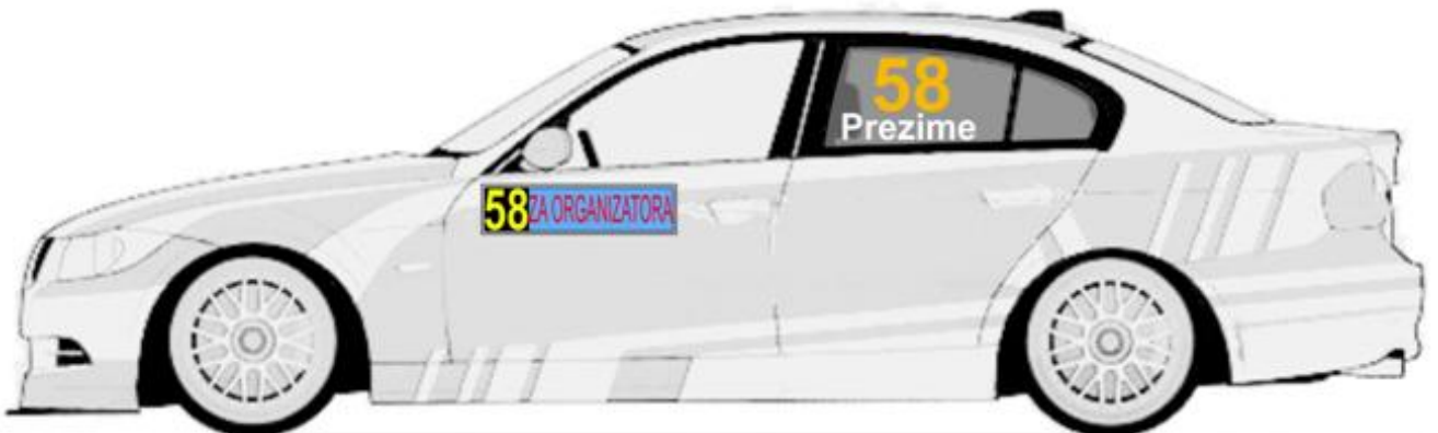
Zadnjim levim i desnim bočnim staklima, broj je visine 20cm sa debljinom linije od 2.5cm, font je Arial BOLD

Boja ovih brojeva je florescentno narandžasta i to PMS 804