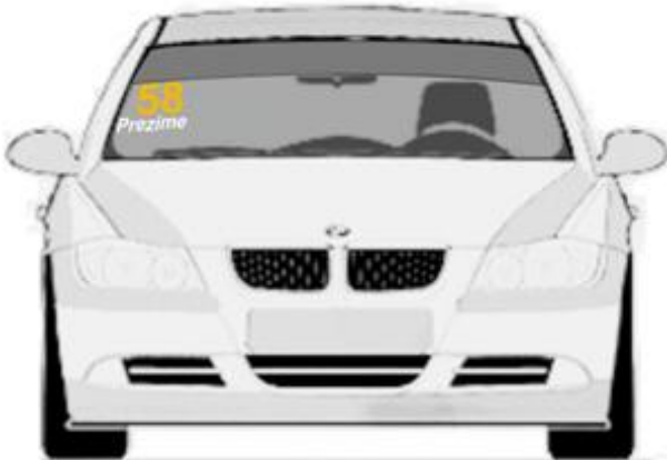
Prednjem vetrobranskom staklu. broj je visine 14cm sa debljinom linije od 2cm, font je Arial BOLD